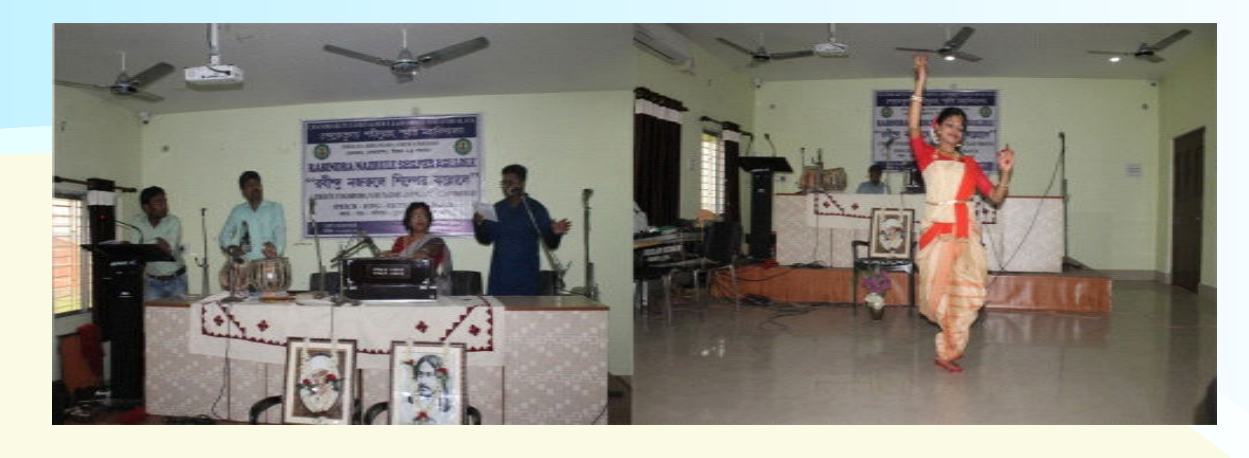
CELEBRATION: BIRTH ANNIVERSARY OF RABINDRA NATH TAGORE AND NAJRUL ISLAM ORGANIZED BY: CULTURAL COMMITTEE, CSSM.