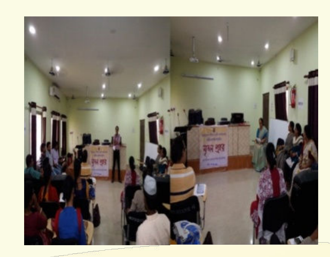
CREATIVE HOUR ORGANIZED BY THE CENTRAL LIBRARY OF THE COLLEGE