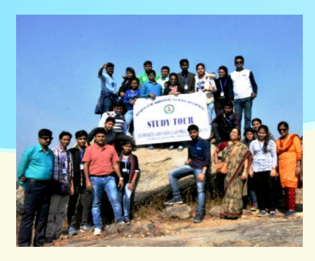
STUDY TOUR ORGANIZED BY: DEPT. OF AGRICULTURE AND RURAL DEVELOPMENT