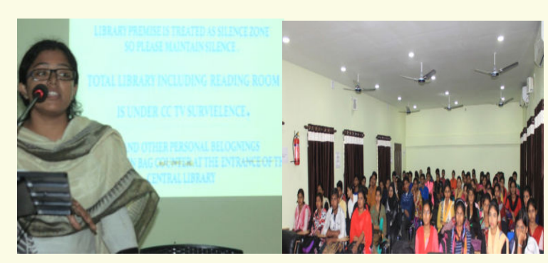
Orientation Programme for the students

'Srijon Prohor': Organized every month by the college Central Library for the staff of our college. teachers and members of the staff presented their original writings which bear marks of their creative impulses. A book is donated to the library with a signature of the participants on them on each of these meetings